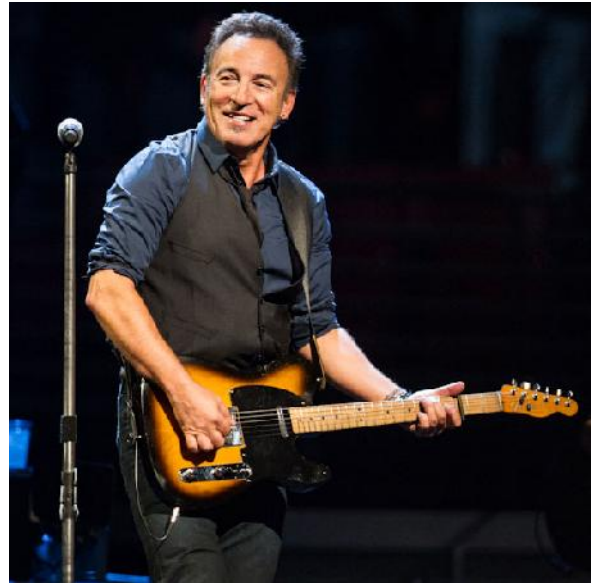
Bruce Springsteen, Philly, March 28, 2012

http://www.youtube.com/watch?v=df5kWft4N_A