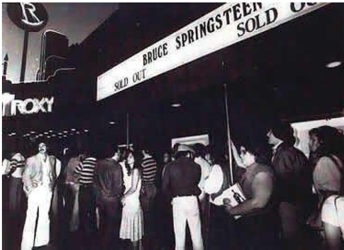
October 17, 1975 — a life-changing event

Preparation for my pilgrimage commenced with a daimoku campaign, the most practical method I know for the fulfillment of desires. After a Buddhist lifetime of good fortune, few personal items remain on my bucket list, but seeing Bruce is never checked off, even after some 70 shows, starting in 1975, when I saw him at the Roxy nightclub in LA. In the Bruce