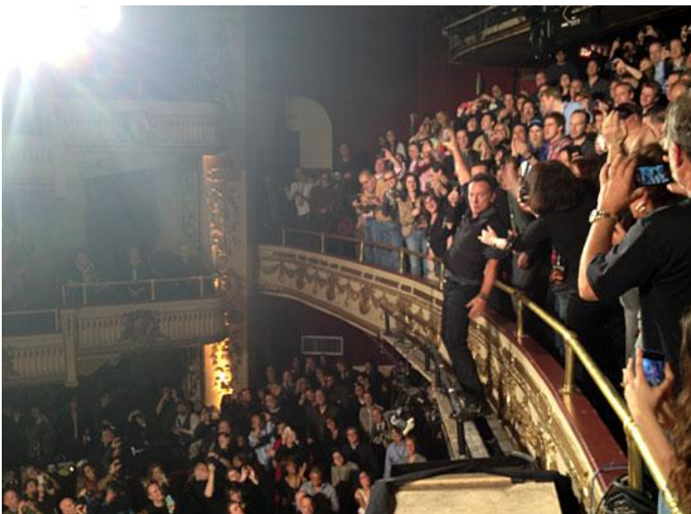
March 9, 2012, Apollo Theatre, Harlem, NYC

Springsteen’s passion, his commitment, dedication, the way he merges the spirit with the flesh, have not dimmed a whit over the 40+ years he’s been performing. His stamina is as incredulous as ever, perhaps more, considering he’s 62. The show starts at a grand climax and builds from there. He gives everything he’s got every single time. At an age that should have long ago seen the end of crazy antics, there he is, sliding on his knees, jumping on the piano and leaping into the crowd. At the tour premiere at the Apollo Theatre in Harlem,