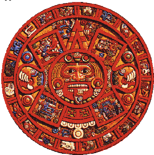
The Mayan Calendar...looks a little ominous...

Personally, I don't believe that Armageddon is just around the corner; I think we're in the middle of it right now . Still, my fervently held prediction is that the world will not end in 2012, but will change in a way that makes all the other changes we've seen in the past look like kid stuff. World events keep vying with each other to push the boundaries of sensationalism. Things are accelerating so quickly, I'm certain there are now fewer hours in the day and that the Earth is spinning faster. In this ever-wilder climate, anything could and probably will happen.