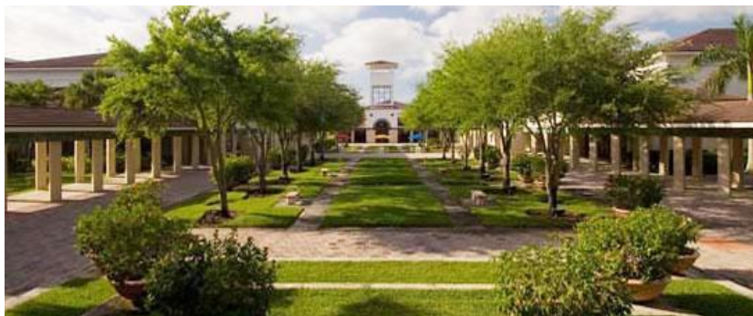
Florida Nature Culture Center – FNCC

grandchildren to FNCC or for any other reason. However, it is interesting that this situation surfaced at the same time I am working to pull money together for the May contribution campaign. I know what value is created by our donations to SGI, including keeping the lights on in our many community centers. What value would be created from donating to the church cause? I continue to chant about this dicey dilemma, unsure of what to do, while I also chant about the even more urgent matter of